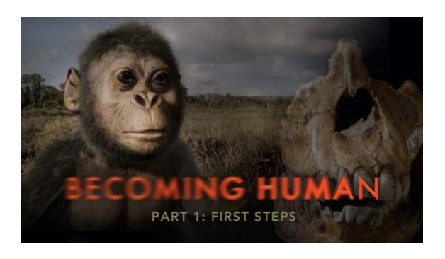
(180 min., 2010, UM DULUTH Library Multimedia GN282 .B436 2010 DVD)

This week we're going to have our first look at Becoming Human —NOVA's three-part series on Prehistoric Cultures. This week we take the " First Steps. " We'll take the second step next week with "Birth of Humanity," and the third step Week 11 when we look at "Last Man Standing."